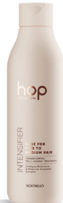
HOP INTENSIFIER BASE FOR FINE TO MEDIUM HAIR.

Un tratamiento spa antienvjecimiento personalizado para abordar las principales necesidades individuales del cabello de tus clientes.