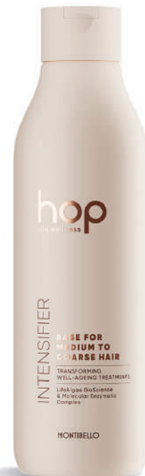
HOP INTENSIFIER BASE FOR MEDIUM TO COARSE HAIR.

Mix the product using the applicator bottle: 4 pumps of the recommended intensifier + 1 pump of the recommended concentrate. Apply directly and leave the product between 7 and 10 minutes and rinse.