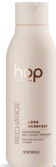
HOP RECHARGE COLOUR CONCENTRATE. (Concentrate for colour and shine retention).

Restores the hair's external layer, protecting it from oxidative stress, making hair colour last longer and boosting the vibrancy and shine of hair.