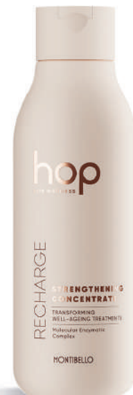
HOP RECHARGE STRENGTHENING CONCENTRATE. (Strengthening concentrate).

Recovers the hair's internal structure, improving elasticity and resistance to breakage in fragile and/or damaged hair.