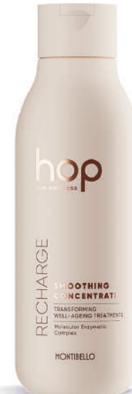
HOP RECHARGE SMOOTHING CONCENTRATE. (Concentrate for softness).

Forms a protective barrier to lock in moisture, add softness and keep frizz under control, even in high humidity.